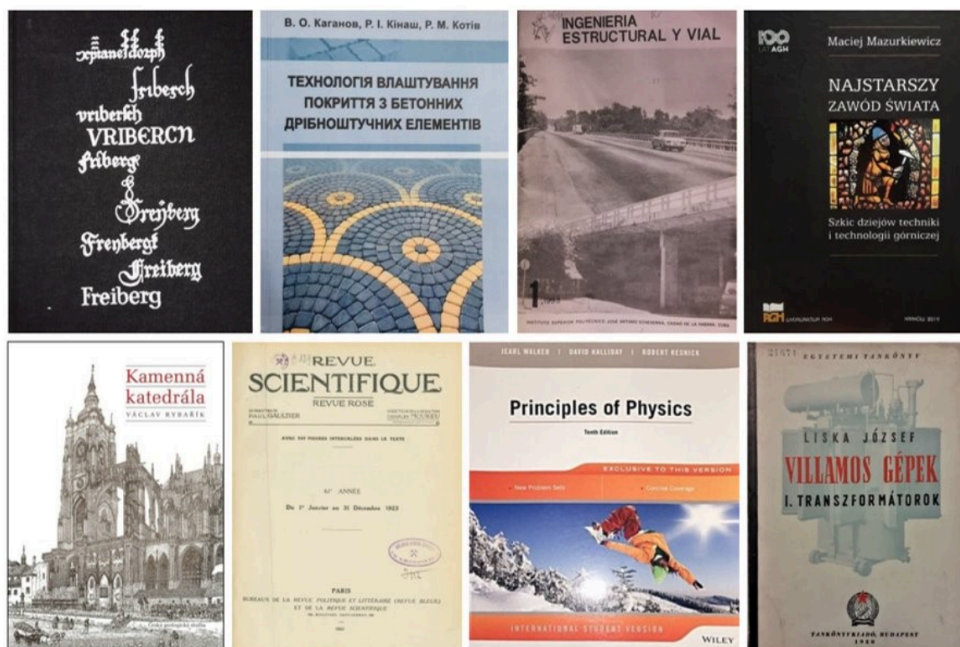
Figure 1: Prints from AGH Main Library collection in various languages (German, Ukrainian, Spanish, Polish, Czech, French, English, and Hungarian)

The first international loan took place in 1972. A professor requested a conference paper from Bergbau-Bücherei in Bochum, Western Germany, one of the oldest libraries in the Ruhr area. It was managed without payment, as the libraries were operating exclusively on mutual agreements. To this day, German libraries remain our closest partners, both lending and receiving materials.